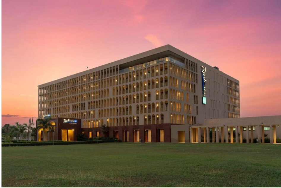
Radisson Blu, N'Djaména